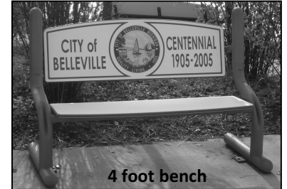
4 foot bench